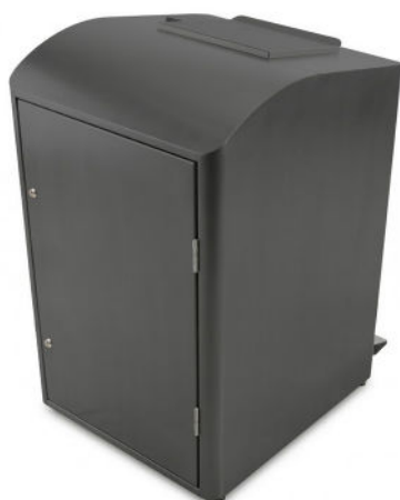
Rear door version