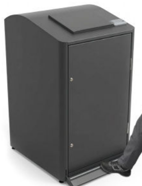
Anti-vandal system to preserv the pedal drive