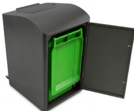
Rear door version