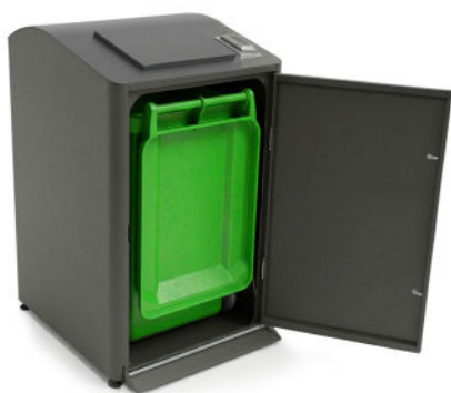
Front door version