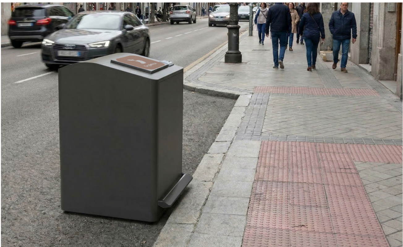
example's installation of rear door version, with the pedal drive at maximum height to save the curb step