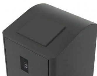
Lector can be placed on the Top or on the Front