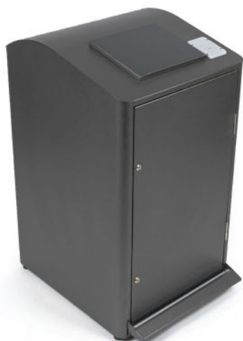
Frontal door version