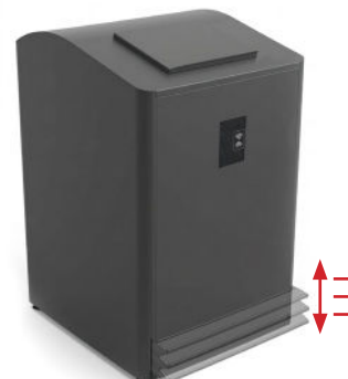
Three pedal height adjustments in back door version