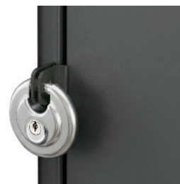
Optional accessory padlock support and padlock