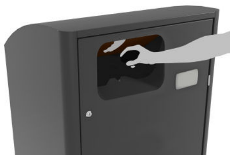
Frontal self-closing flap with access-controlled opening