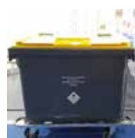
Bumper made of metal