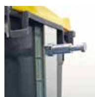
Removable lifting trunnions