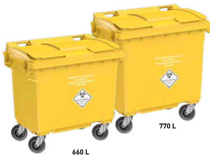
660 L 770 L