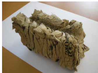
Small and compact briquette