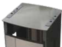
Hood mounted ashtrays