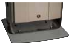
Free standing base kit (60 litre model only)