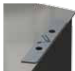
Ashtray volume: 1 litre