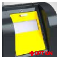
Big user flap for Glas and Packaging W 800: 420 x 400 mm