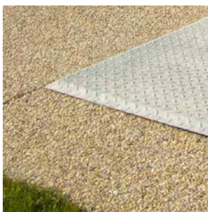
Bulb plate 30°