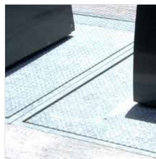
Bulb plate 90°