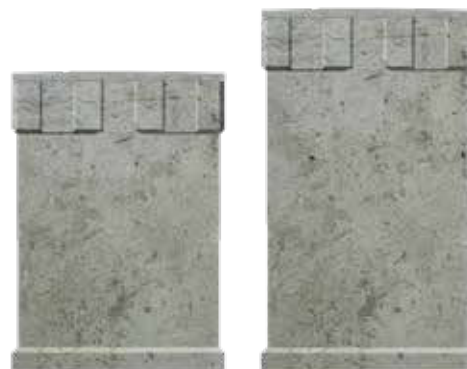
4 m 3