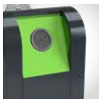
Glass, throw-in width 200 mm