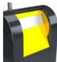
Paper, Packaging - Rectangular slot 150 x 490 mm