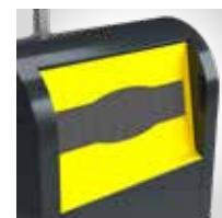
Packaging / Paper - 150 x 680 mm (rectangular with circle in the middle)