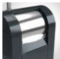
Regular Waste - Double Drum Stainless Steel 40 / 60 / 80 / 110 L