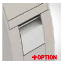
Regular Waste Filling chute 40/60/80/110 L