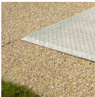
Bulb plate 30°