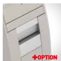
Packaging, Paper - Rectangular slot 150 x 400 mm 200 x 400 mm