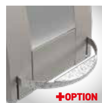
Foot pedal for regular waste filling chute 110 L Width 670 mm