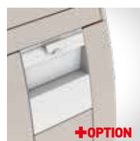
Big user flap 380 x 360 mm