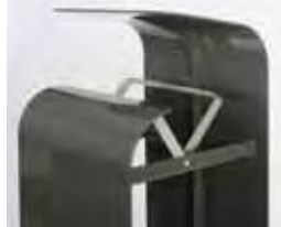
Sack Retention System

Capacity: .....Up to 80L Height: .....1116mm Height of Aperture:.....961mm Width: .....360mm Depth: .....320mm Weight:.....31kg