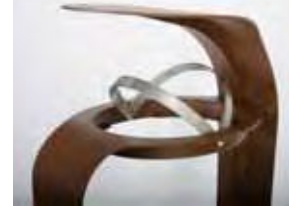
Sack Retention System

Capacity: .....Up to 80L Height: .....1084mm Height of Aperture:.....900mm Width: .....287mm Depth: .....407mm Weight:.....17kg